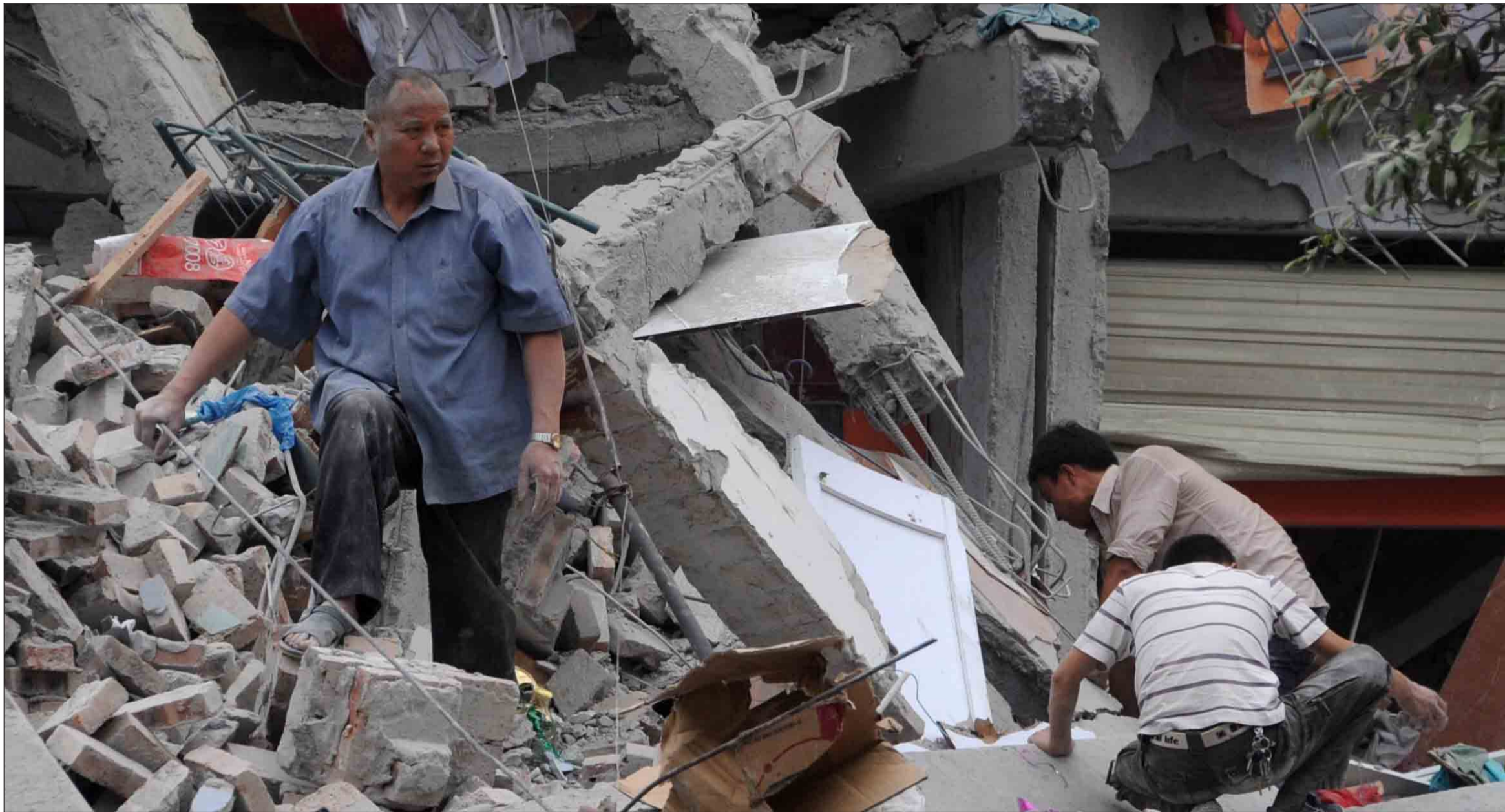
Quake survivors look through the rubble of their collapsed homes in Dujiangyan, Sichuan, following yesterday's earthquake. Aftershocks continued to be felt into the night.