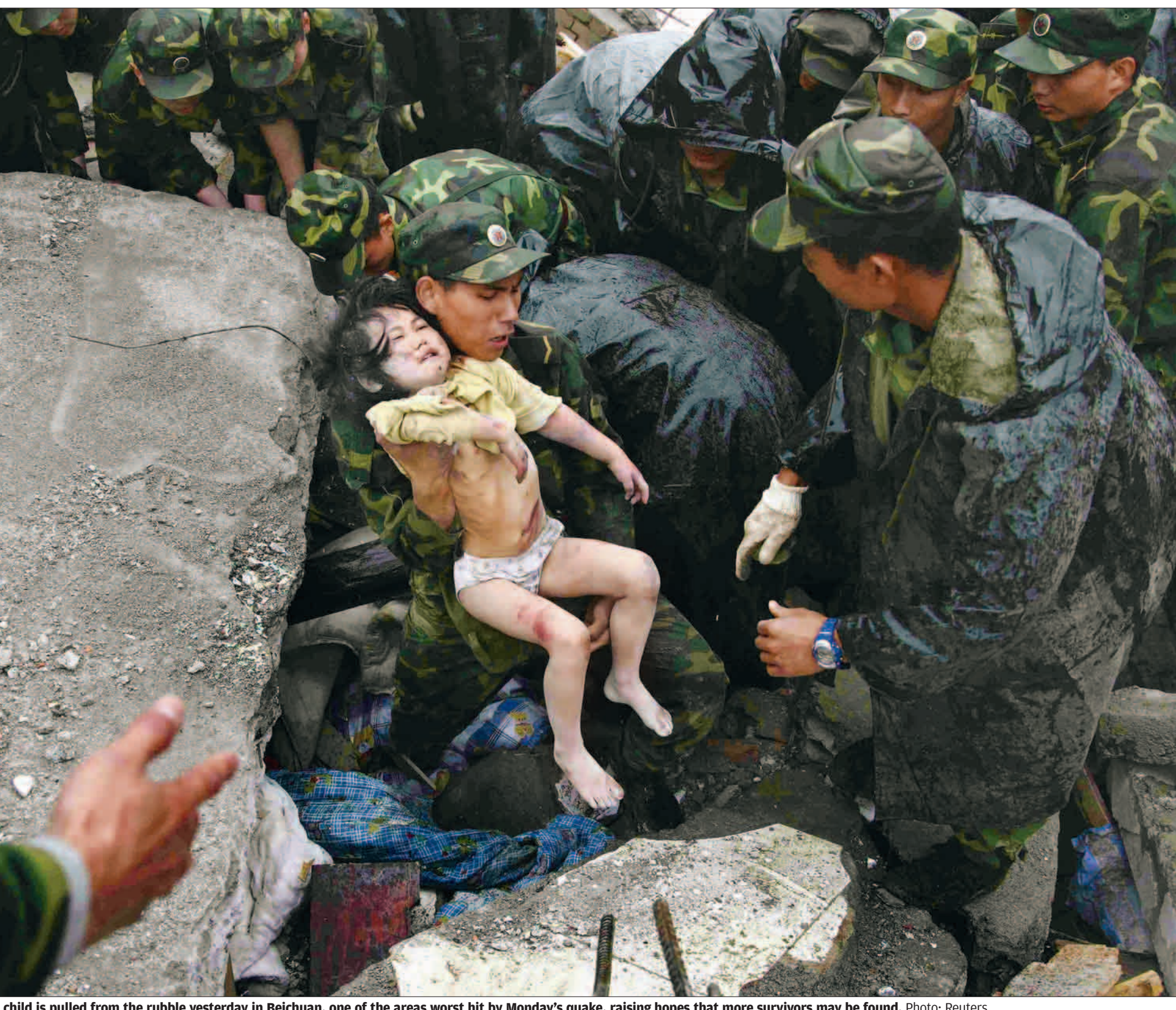
A child is pulled from the rubble yesterday in Beichuan, one of the areas worst hit by Monday's quake, raising hopes that more survivors may be found.

He called on people to be united to face up to the rigorous challenges to save lives and ensure sufficient food, water and other supplies.